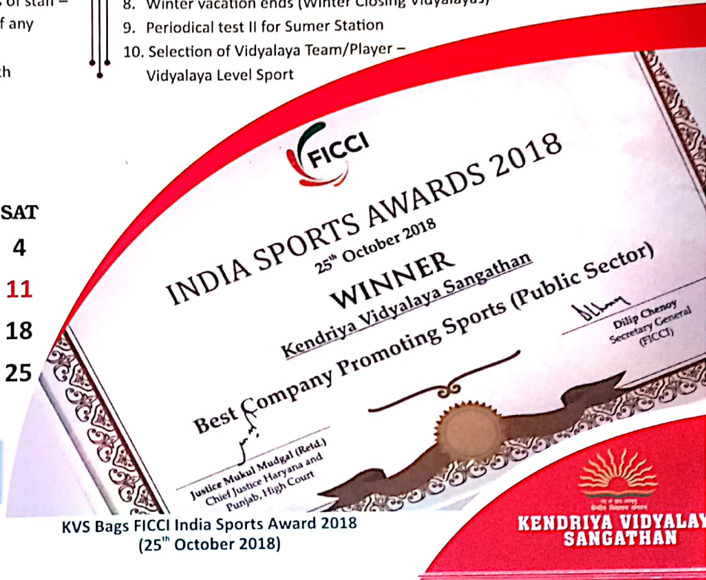
KVS Bags FICCI India Sports Award 2018 (25 th October 2018)