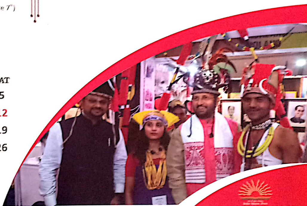
KVS National Integration Camp-Ek Bharat Shreshth Bharat (31 st October - 2 nd November 2018)

2 nd Gandhi Jayanti 8 th Dussehra (Vijay Dashmi) 27 th Diwali