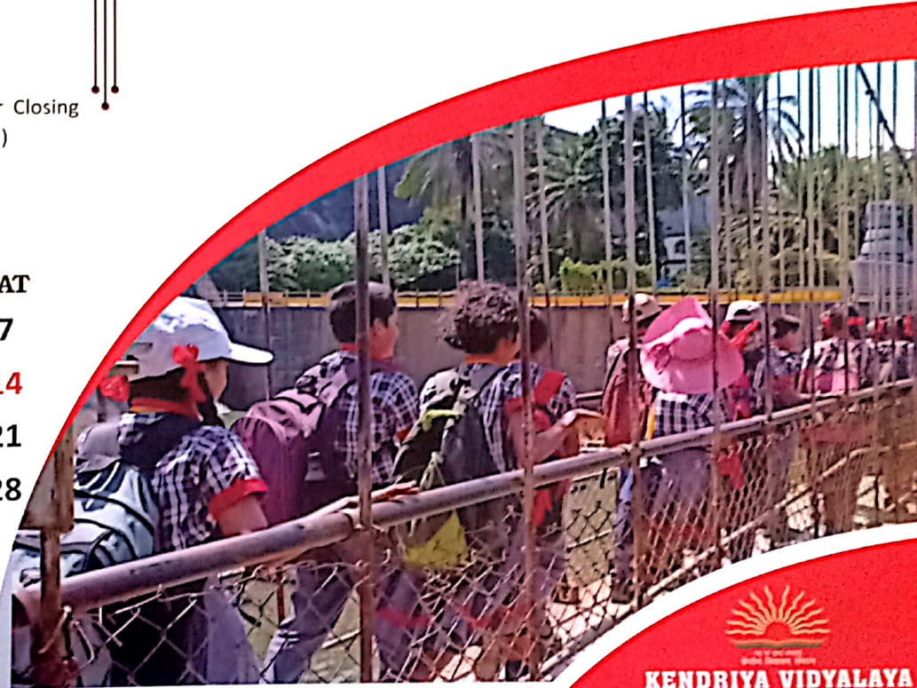
Paryatan Parva celebrated in all the Vidyalayas (KV Perookada)